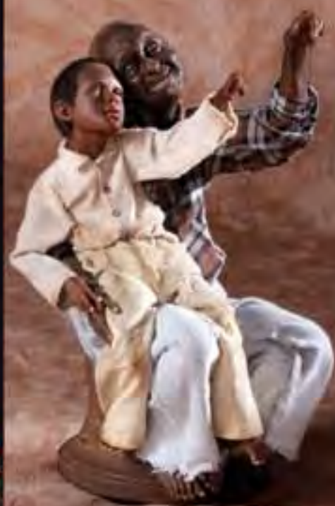
Stories with Grandpa T43419 12" Grandpa, 9" Grandson, seated on a 4" round wooden base. One-Of-A-Kind $2500