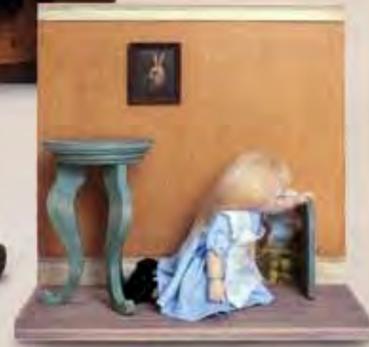
Alice And The Little Door T45615 7" Alice with wooden room. 11"t x 12"w x 6"d LTD 20 $1730