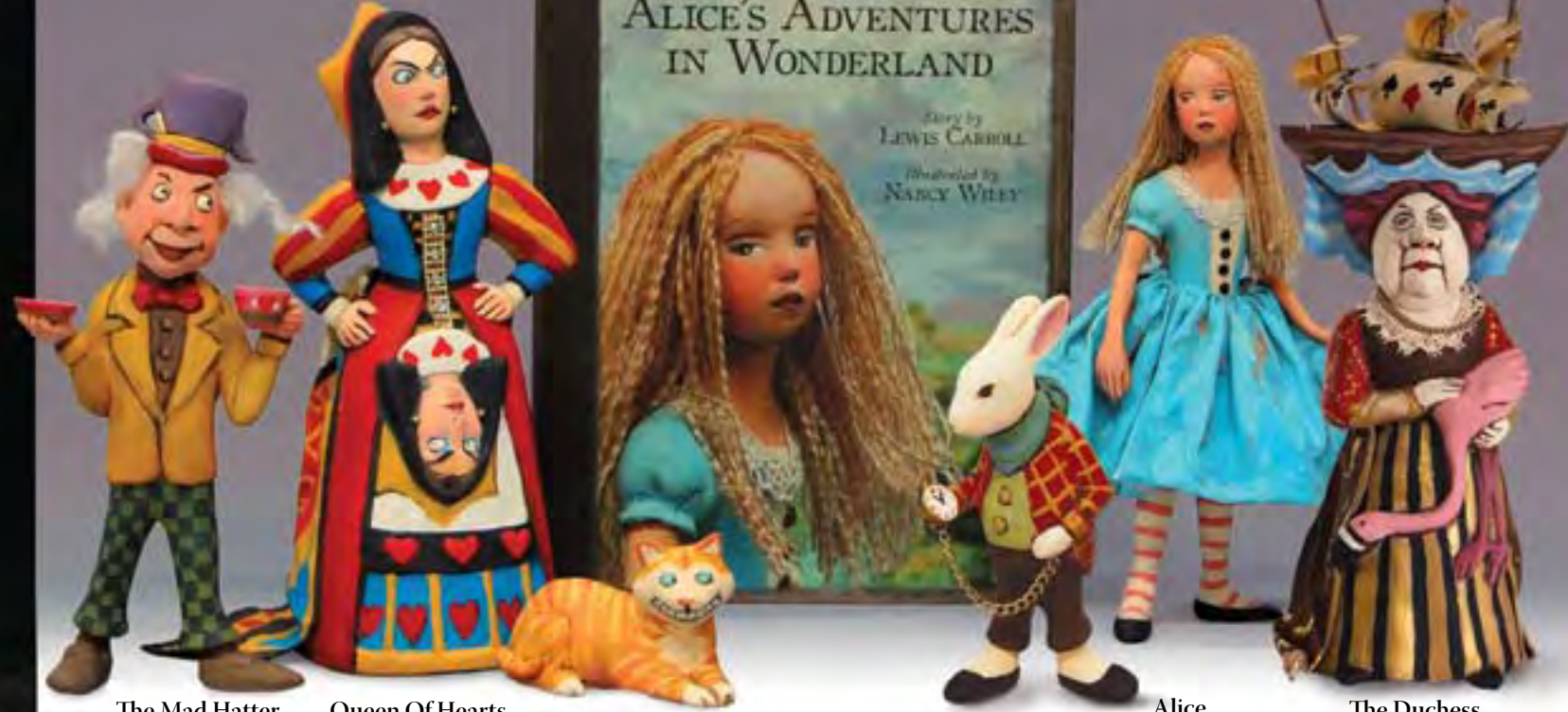
The Mad Hatter

Alice's Adventures in Wonderland Book T47791 82 page, signed hardcover book. $35