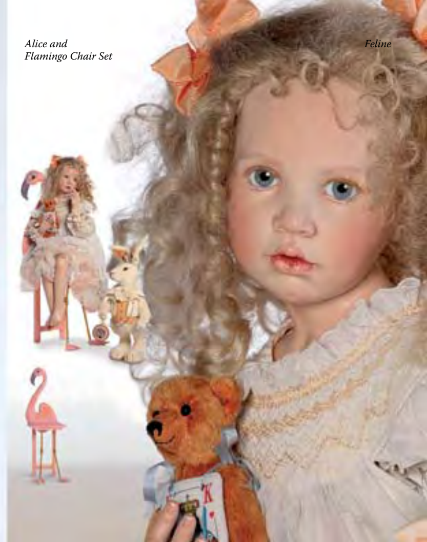
Alice and Flamingo Chair Set