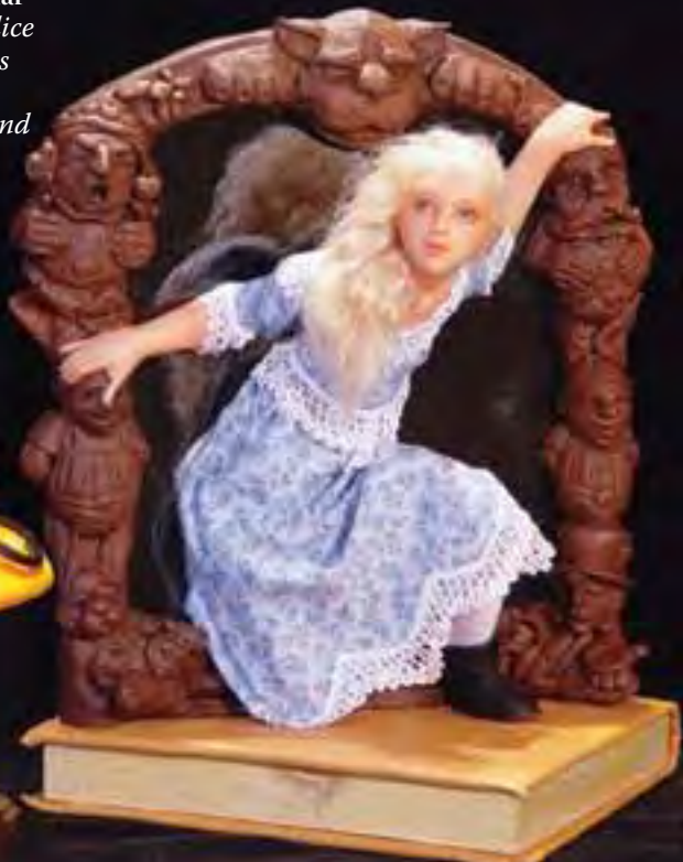
Looking Glass T48857 10" Alice steps through the handcrafted looking glass. One-Of-A-Kind $1600