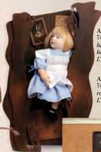
Alice Down The Rabbit Hole T45614 7" Alice with her handcrafted wooden rabbit hole. 12.5"t x 7"w x 2.5"d LTD 20 $1730