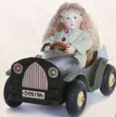
Dorothy with Car T28166 11" comes complete with a wonderful handmade wooden car. LTD 25 $2445