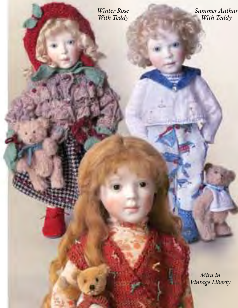
Winter Rose With Teddy