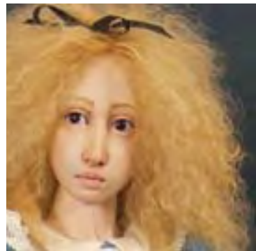
Alice T48512 14" seated. Finished in over 18 layers of artist's oil paint, gouache and a very special matte varnish. In her lap, she holds a velvety top hat for a special friend. LTD 15 $1400