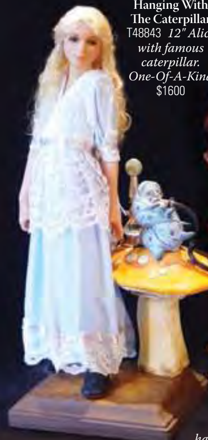
Hanging With The Caterpillar T48843 12" Alice with famous caterpillar. One-Of-A-Kind $1600