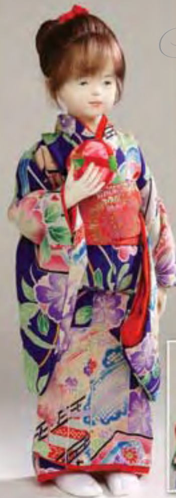
Girl With A Ball T40617 16" paper clay covered with silk. Silk kimono is fully lined. LTD 3 $3400