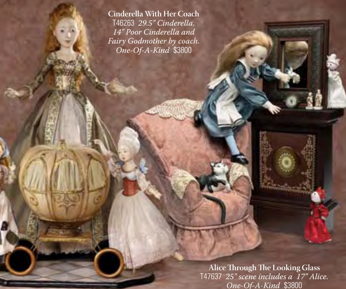
Alice Through The Looking Glass T47637 25" scene includes a 17" Alice. One-Of-A-Kind $3800