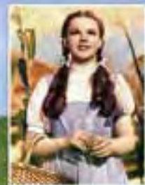
Dorothy Gale T45740 16" LTD 500 $1575