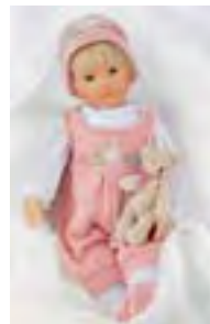
Das Kleine Du Mein T47785 17" modeled after the 1920s Du Mein Hampelchen Baby. LTD 125 $1188

Created today with the same careful attention to detail and using the original patterns, Käthe Kruse Classic Dolls continue to be made of cloth, stuffed with reindeer hair and painted by hand. Recognized the world over as the epitome of the classic doll, these dolls are in a class of their own. No doll collection is truly complete without at least one Käthe Kruse creation.