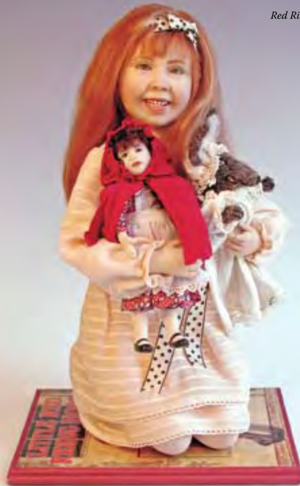
Red Riding Hood and Wolf