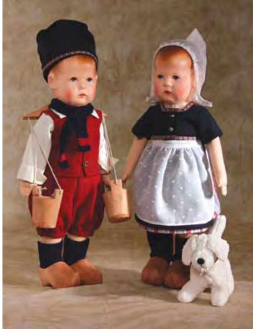
Kathrinen & Lütt Matten T43018 17" Dressed in typical Dutch style, both dolls are based on the Doll I, considered by many aficionados to be the quintessential Käthe Kruse doll. LTD 50 $995 each $1958 set