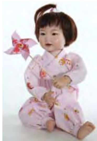
Asian Toddler in Pink Romper T48524 8.5" Head and limbs sculpted from polymer clay with a firmly-stuffed cloth body so she can easily sit up on her own. One-Of-A-Kind $1000