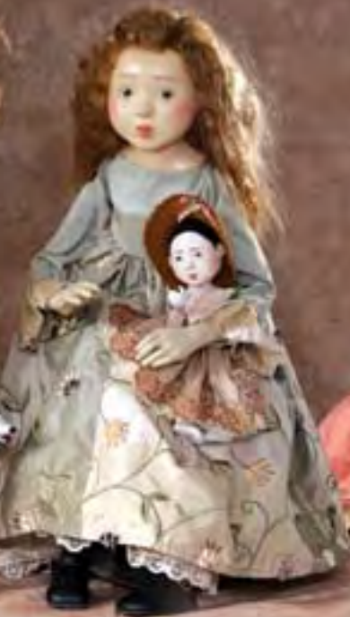
Girl With Small Music Box T47639 15" with wind-up music box. One-Of-A-Kind $2400