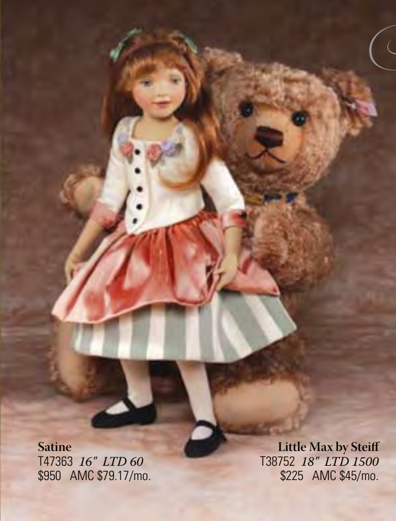
Satine T47363 16" LTD 60 $950 AMC $79.17/mo.