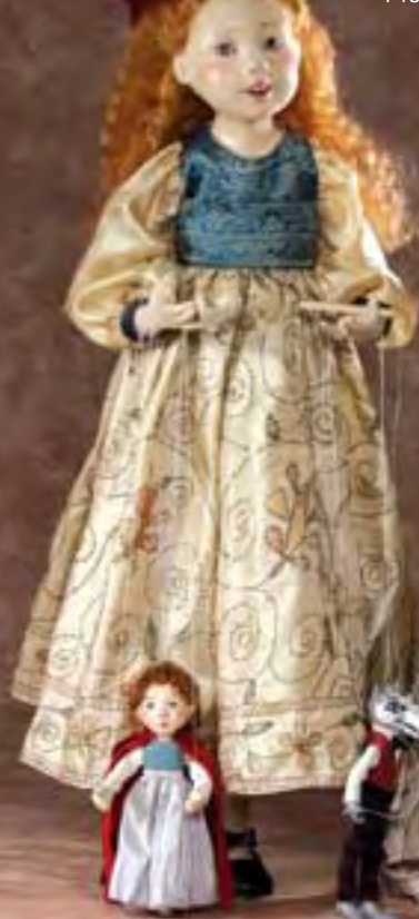
Girl In Embroidered Dress T43336 22" One-Of-A-Kind $1695 AMC $141.25/mo